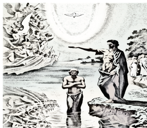
Baptism of Our Lord